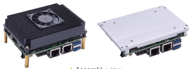
▲ Assembly view