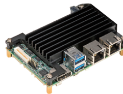
▲ Assembly view