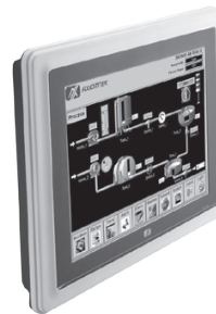
▲ Side view