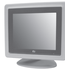
▲ Desktop stand