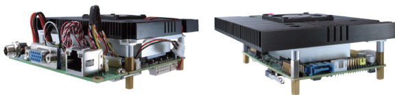
▲ Assembly view